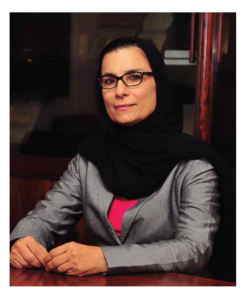
البروفيسورة شيخة المسند رئيس جامعة قطر