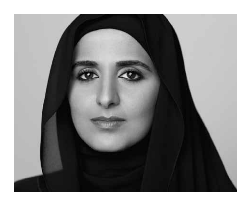
سعادة الشيخة المياسة بنت حمد بن خليفة آل ثاني رئيس متاحف قطر

H.E Sheikha Al Mayassa bint Hamad bin Khalifa Al Thani Chairperson of Qatar Museums