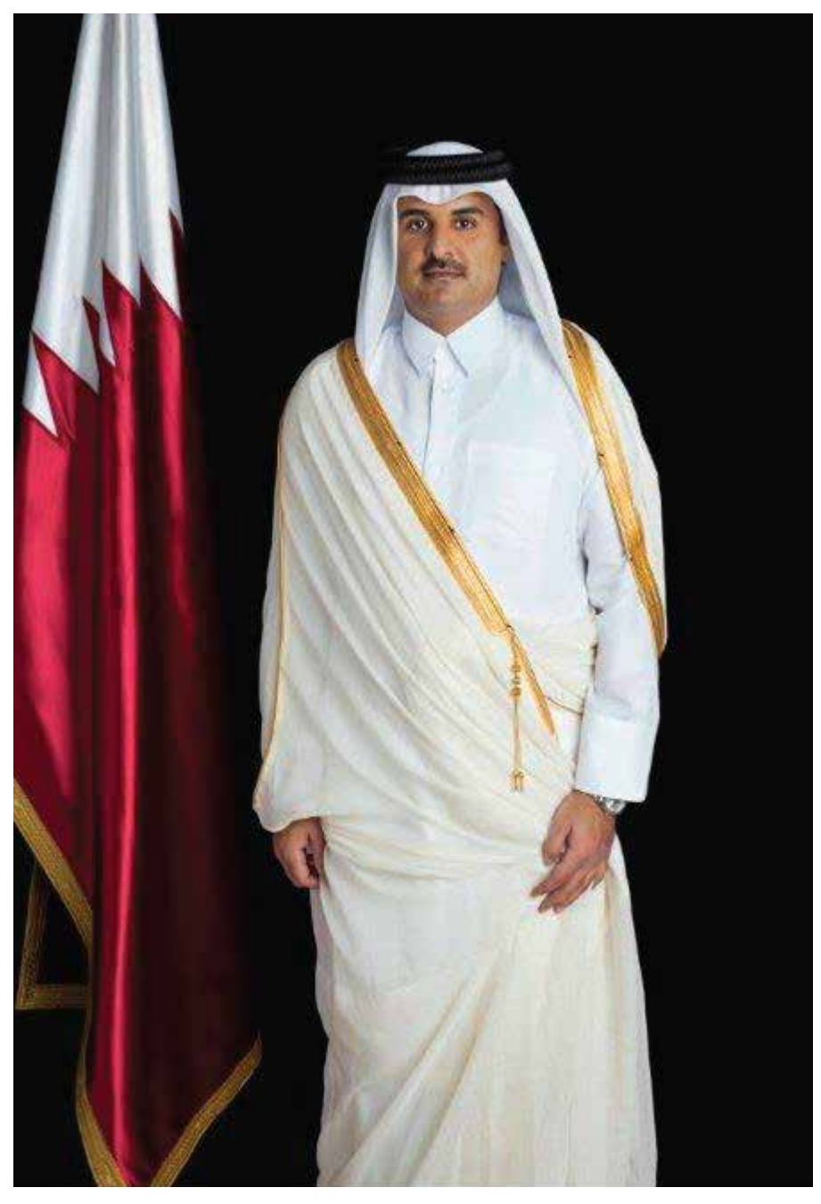
حضرة صاحب السمو الشيخ تميم بن حمد آلثاني، أمير البلاد المفدى His Highness Sheikh Tamim Bin Hamad Al-Thani, Emir of the State of Qatar